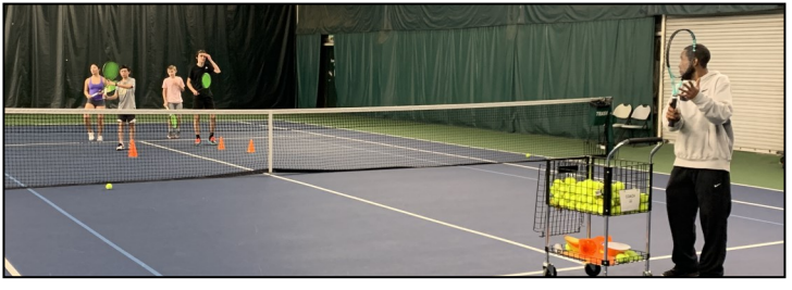
Junior High Performance with JJ Jackson